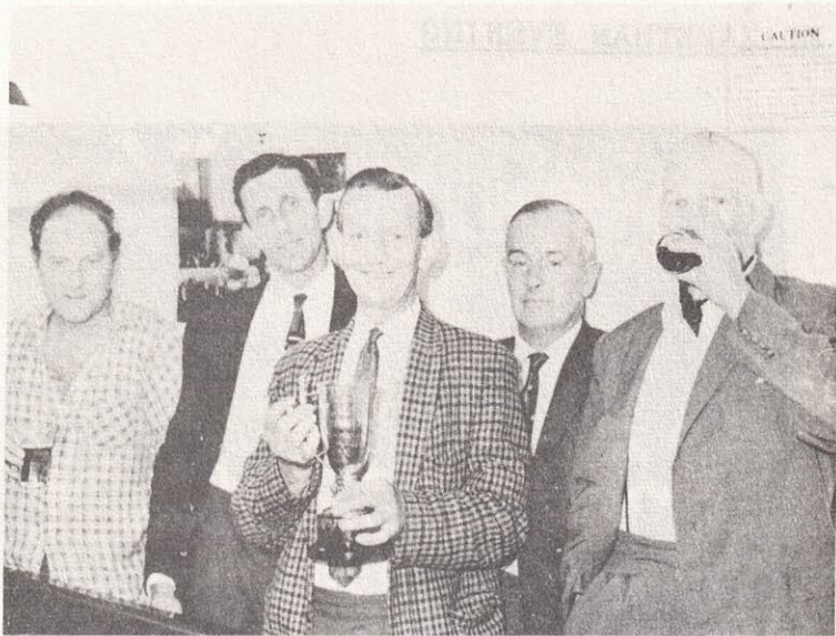
THE LOAD OF MISCHIEF BAR BILLIARDS TEAM Winners of the Wallingford & District League.