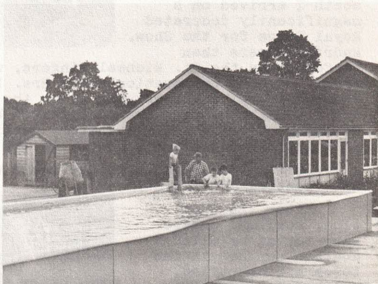
THE SCHOOL SWIMMING POOL NEARING COMPLETION